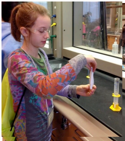
A chemistry exercise was one among many of the Tech Savvy activities planned for middle school girls at the Greensboro conference.

The young women who attended the conference were challenged to create animations and video games using MIT’s “SCRATCH” software; develop Android mobile applications; and work with LEGO® Robotics. Several experiments involved the application of physics principles using coil loops, pennies, jump ropes and liquid nitrogen. The young women were also guided in building basic models of a radio, a generator, and a motor.