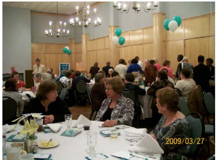
AAUW NC Convention 2009: Wilmington branch members enjoying lunch